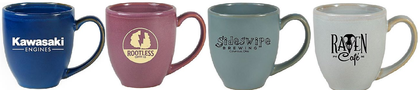
# 1376-Antique Blue