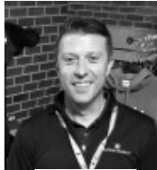
BATES GROUP EST. 2019