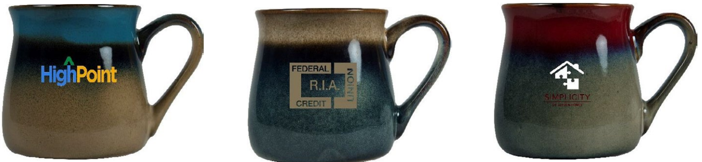
#4416 16 oz. Blue/Tan